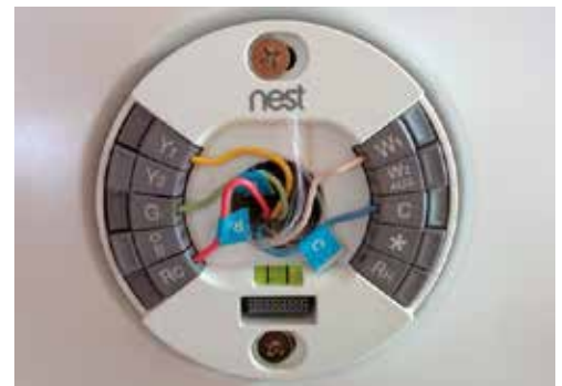
Industrial Tools: Complex Parts with Specialized Relationships B