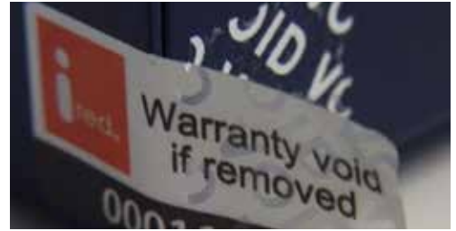
Industrial Tools: Self-repair is Discouraged by Financial or Legal Pressures 5

attending many hours of classes, when the guts of all of these products are fairly similar and made up of the same elements he has manipulated for half of his life. As producers narrow the range of allowable repairs and repair methods, they rule out almost entirely the old culture of inventing new solutions with old parts – of innovating and advancing the home through creative maintenance. If homeowners want to take on this closed organization of parts, ideas and legal constructs, they are forced, in effect, to operate in a fringe world, a pirate world in which a simple mistake can have large cost and legal implications.