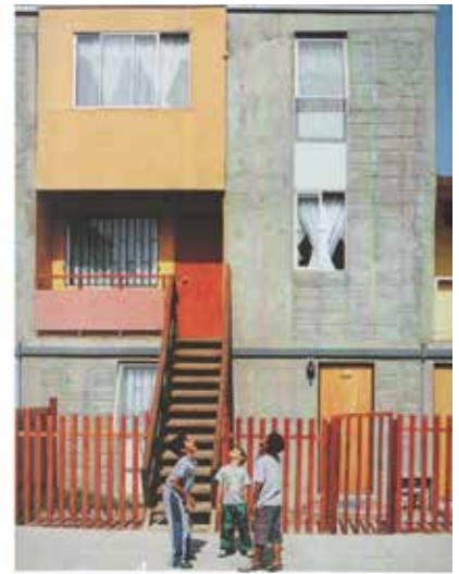
36 m 2 + 36 m 2 = 72 m 2 Si se repite (se repite) and the second half if value from self-repairs had the final value is more than US$1,000 = US$20,000

Allows Users to Save Through Self-Repair and Self-Modification, Generating Added Value for Themselves Through Personal Energy. 0