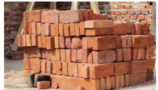
Convivial Tools: Generic Elements with Little Regulation E

It is not often that we take note of or praise something for being generic but it is this very generic-ness of object and idea that gives the greatest freedom at the lowest cost to the homeowner. Compared to institutionally-scaled buildings, few elements of the common home are owned or regulated such that they cannot be modified, replaced, repaired, or inventively re-purposed at the sole discretion of the homeowner. While home repair has not historically participated in the innovations adopted by institutional architectures, it does have a rich culture of simple, one-off, site- or problem-specific innovations driven by a dearth of limitations. The elements of typical home construction are not menaced by the shadows of great cost or fragility, or by the imposition of “correct” behaviors dictated in warranties and liability documents. They can be cut up, melted down, twisted, fudged, glued, screwed, stacked and played with until a solution to the problem at hand is reached, all without great consideration of what is “allowed” or “approved” or “not in violation”.