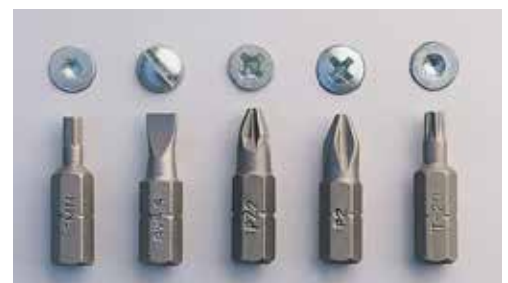
Convivial Tools: Elements Speak to Their Own Use and Manipulation C