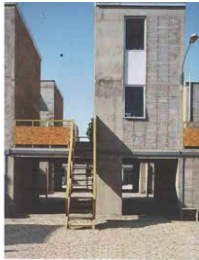
36 m 2 Si la primera mitad de la casa costó if the first half of the house cost was US$7,500

Provides Free and Broad Access to the "Base Code" N