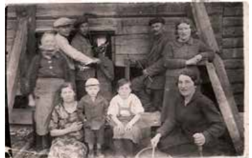
Convivial Tools: Freedom to Exercise Personal Energy Under Personal Control 6

For most people in the West, industrial tools, which require capital to obtain and maintain, are far more expensive than the products of their own labor produced in concert with convivial tools. This disparity is amplified when we speak of a “product” as material- and capital-intensive as a home. Illich rightly points out the economic leveling power offered by convivial tools, which take advantage of a non-pecuniary wealth: personal energy under personal control, “the one resource that is almost equally distributed among all people.” 5 The convivial home is structured to take advantage of the labor – mental and physical – of its users. The parts and tools that are required for its repair and modification are standardized and genericized to the point of being cheap and easy to obtain. By the input of labor and with minimal capital users can make repairs that suit specifically the circumstances of a breakdown as it relates to their particular homes and lives. By the same means they can readily modify their structure towards better expressions of their community values.