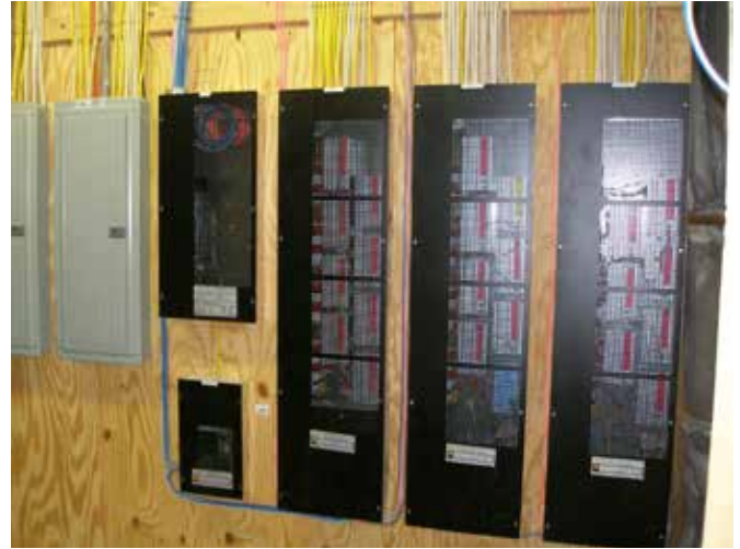
Industrial Tools: Elements are Complex and Closed D

New, industrially deployed home technologies often present to homeowners as conceptual black boxes. In part because of the tiny scale of its operations and in part because of the sealed nature of its physical skin, digital systems like the Nest thermostat are reduced for the homeowner to the flatness of their user interface screens, which have no true one-to-one correspondence with the actions of the system behind the curtain. When the curtain is pulled back, homeowners are not presented with signs and symbols that help them make sense of what is before them. These systems tend not to be made up of easily understood primaries but of myriad further blanks whose precise potentials are often unclear to the uninitiated. This failure to understand, and therefore to know where to begin repairs, both precipitates and is exacerbated by the new culture of seeking specialist outside labor to handle issues off the bat: now the homeowner doesn't even try to open up the assembly before they pick up the phone.