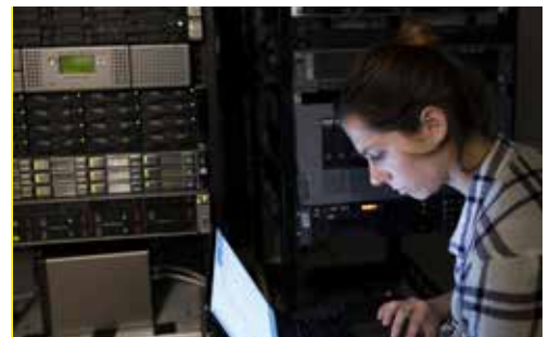
Industrial Tools: Capital Replaces Labor; The Homeowner is beholden to expert contract maintenance or compelled into a cycle of trashable, replaceable components. 1, J

Because of the above-mentioned physical, conceptual and regulatory limits, it is increasingly difficult for users to apply their own energies towards the repair and modification of the industrial tools now laced through contemporary homes. Where the power of their own muscles and minds are limited, the power of their wallets remains. In vacuum left by the denial of self-repair, two significant alternatives have developed. The first, long favored by the wealthy but increasingly adopted by the middle class, is contract repair. Today, when a technology breaks down, specialists in a given industrial tool are dispatched to repair or modify that tool within a set of physical and legal limits and according to their own standards of best practice. These teams of experts come at a cost greatly exceeding the time-value of the homeowner working for themselves and even of traditional skilled repair-assistants like plumbers, plasterers and carpenters. Also unlike those tradesmen, whose work we choose to engage as a surrogate for our own, the involvement of the new expert class is virtually compulsory: our choice is often to engage them for whatever fee they ask or to live with a state of disrepair.